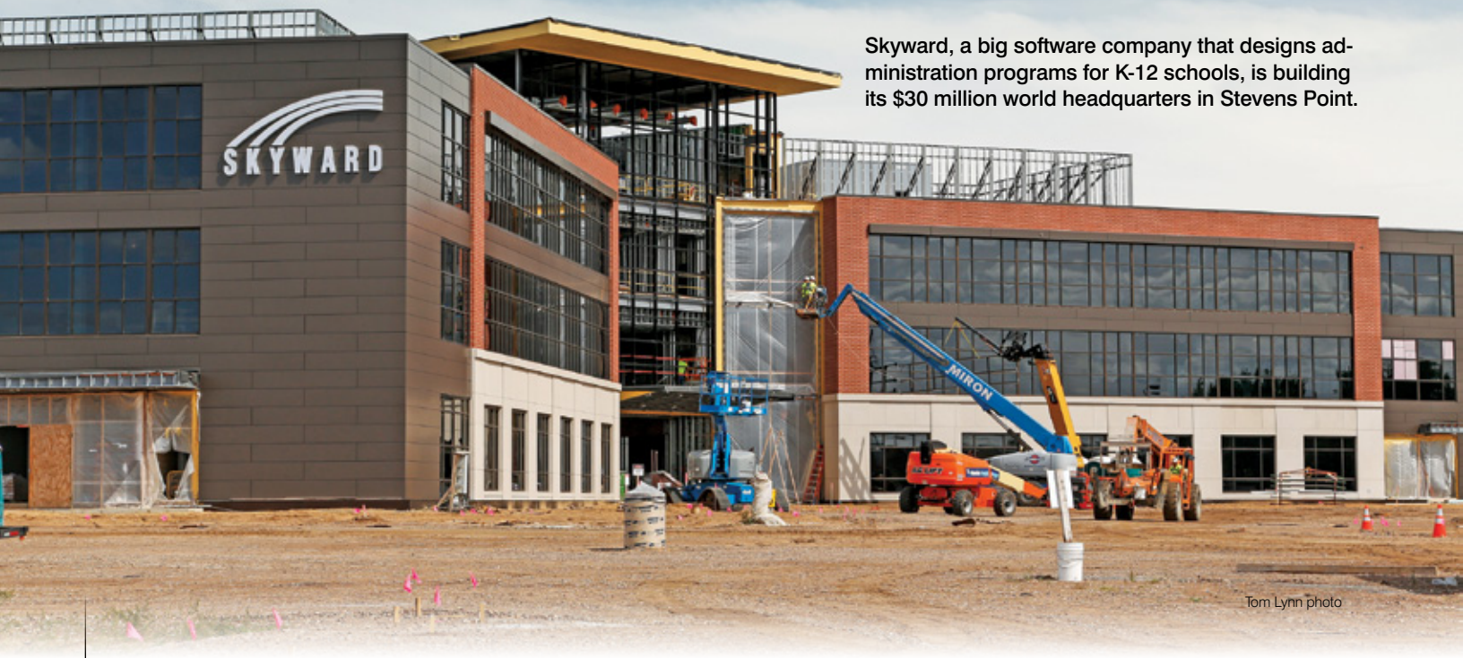
Skyward, a big software company that designs administration programs for K-12 schools, is building its $30 million world headquarters in Stevens Point.