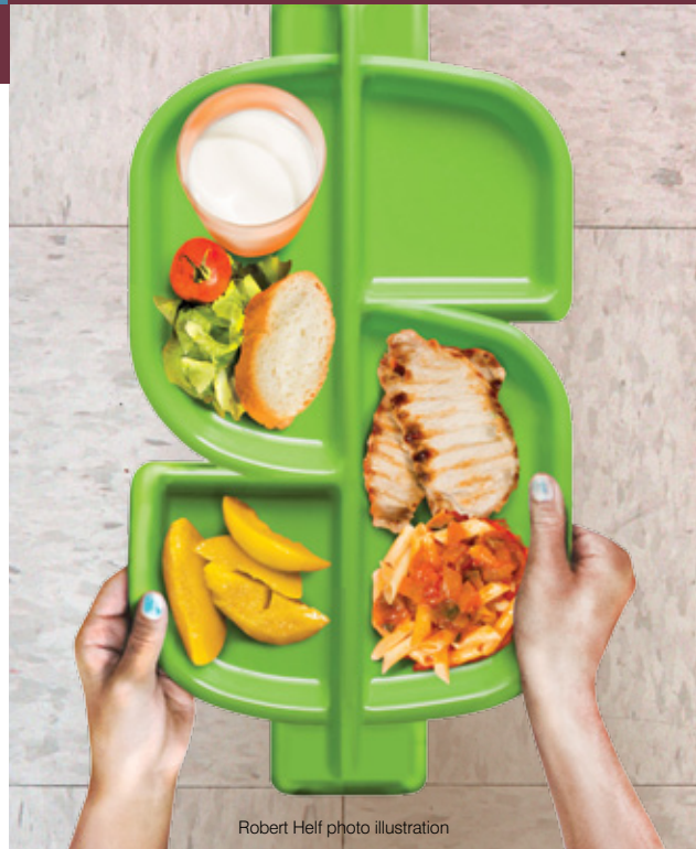
Robert Helf photo illustration