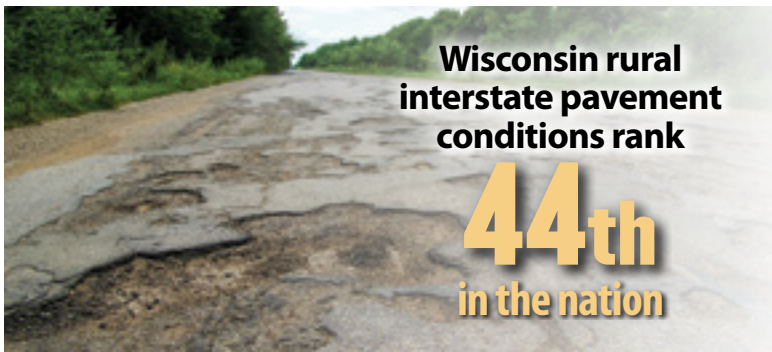
Source: Reason Foundation's 24th Annual Highway Report