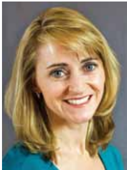
Donnelly: Kids figured out they won’t be disciplined.

Concerns about school safety still dog MPS. Last fall, School Choice Wisconsin released a report showing that juvenile arrests at MPS schools were 27 times higher than at city voucher schools and eight times higher than at non-MPS public charter schools. MPS officials, though, questioned whether any meaningful conclusions could be drawn from a log of 911 calls. They also pointed out that School Choice Wisconsin’s voucher schools are competing with MPS for students.